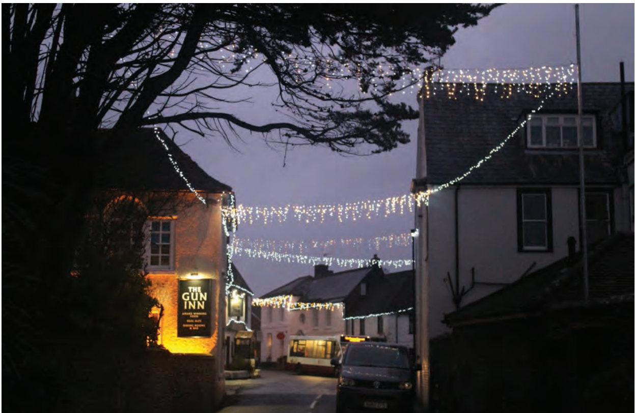
Christmas 2015 - 'Light up The Square' community initiative