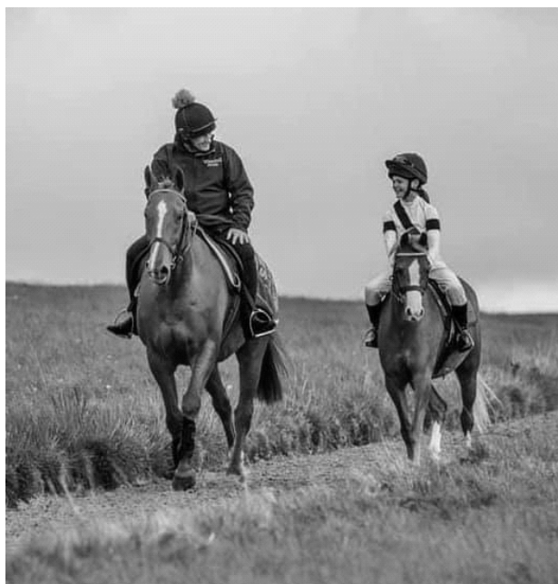
On the gallops again with a new generation

For more information visit www.bobchampion.org.uk .