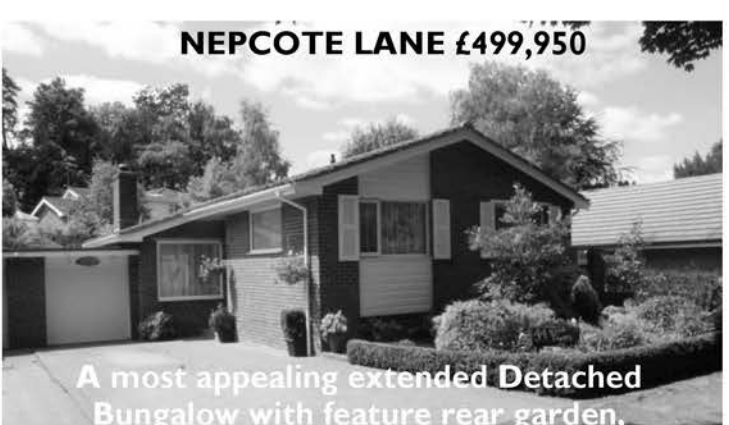
A most appealing extended Detached Bungalow with feature rear garden, located a stone's throw from picturesque Nepcote Green.