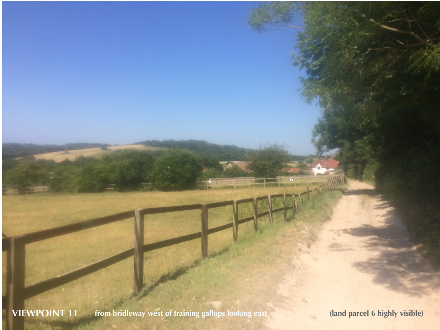
VIEWPOINT 11 from bridleway west of training gallops looking east