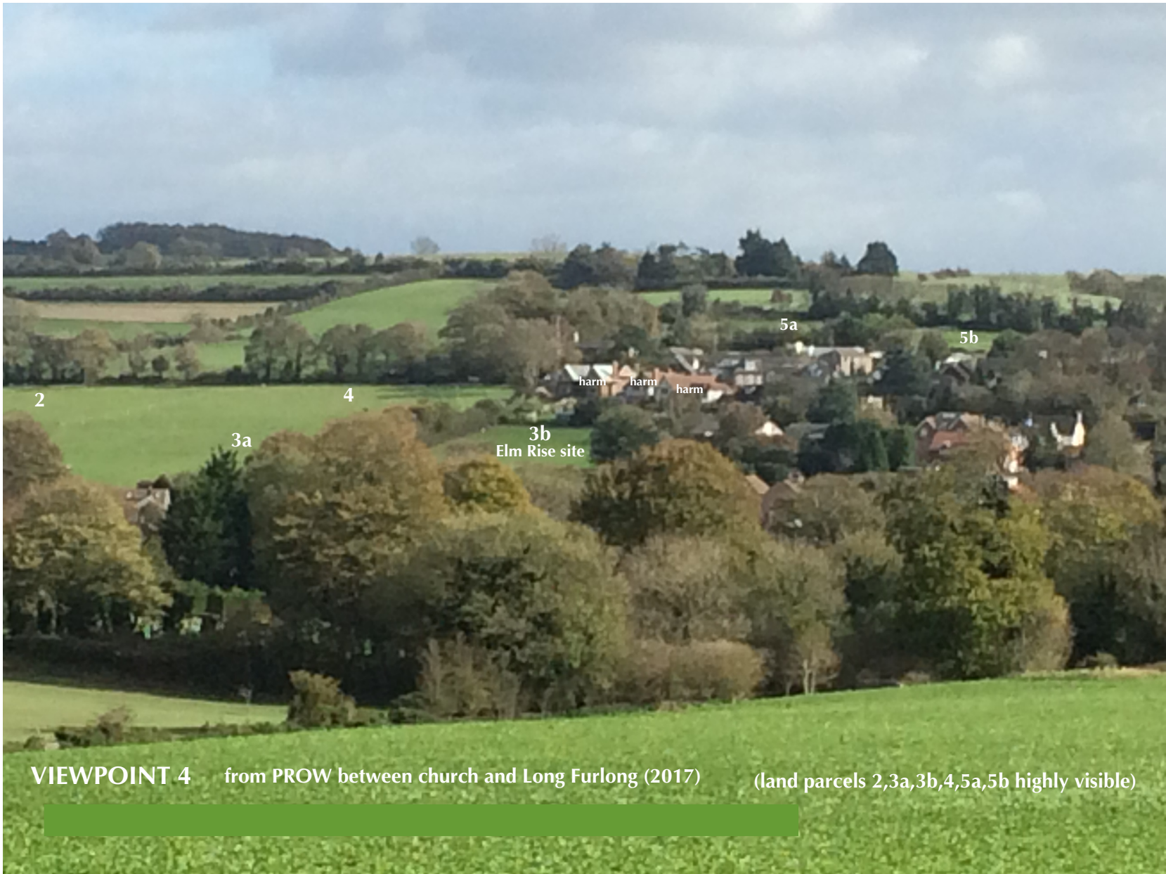
VIEWPOINT 4 from PROW between church and Long Furlong (2017) (land parcels 2,3a,3b,4,5a,5b highly visible)